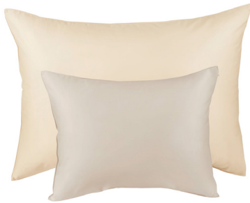
Pair of Pillow Shams

35 x 45 cm • 50 x 70 cm 60 x 80 cm • 60 x 90 cm